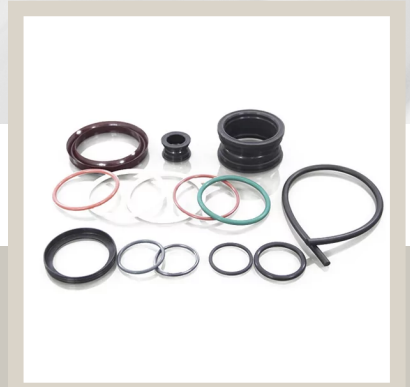
FFKM / FKM / FEP O RING