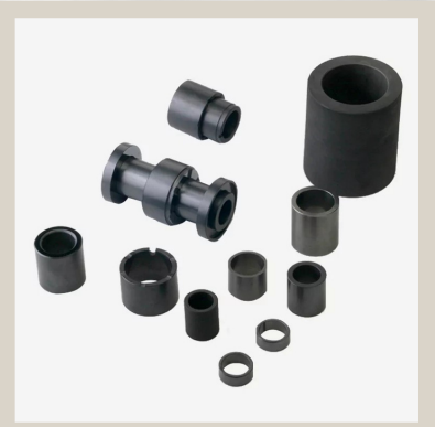
Pump Bushes Silicon & Tungsten