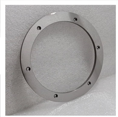
Tungsten Carbide Sand Mill (Bead)