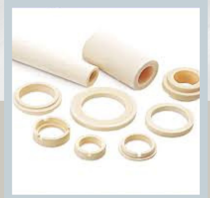
Ceramic Sleeves Seal Faces