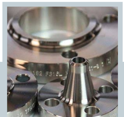
SS316/SS316L SS304/SS304L Customise Product

FOR MORE CARBIDE PRODUCTS PLEASE VISIT OUR WEBSITE