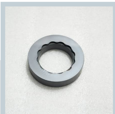
Silicon Carbide Customise Product