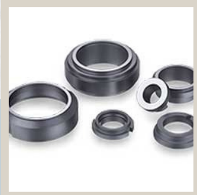
Silicon & Carbon Seal Faces