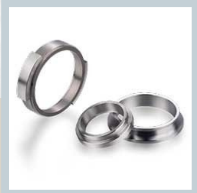
Tungsten Carbide Seal Faces